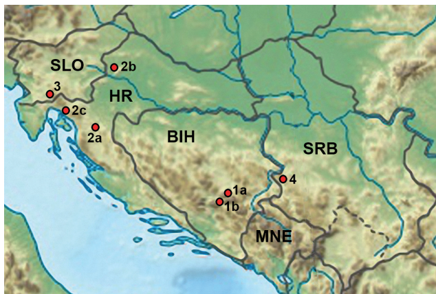
Fig. 3. Xerobdella anulata . Known distribution; 1 = records by Autrum (1958; locus typicus): 1a = Sarajevo, 1b = Bjelašnica; 2 = records by Dresscher et al. (1966): 2a = Vrhovine, 2b = Cesargradaska Gora, 2c = Gorski Kotar; 3 = record by Sket (1968): Snežnik; 4 = first record in Serbia: Rastište. BIH = Bosnia and Herzegovina, HR = Croatia, MNE = Montenegro, SLO = Slovenia, SRB = Serbia. (WCC 2019, map modified by C. Grosser).

separated by 3.5 (Fig. 2B; rarely by 3) annuli. The positions of gonopores differ more in X. praealpina . The male and female gonopores are separated by 6.5 annuli and the accessory pore is situated 0.5 annuli behind the female pore (Fig. 2C). Thus, the three European land leeches can be clearly identified by means of the distances of gonopores and the accessory gonopore. Identification of further material and recognition of appropriate habitats will lead to more findings and expand our knowledge of the distribution of rare European land leeches in the future.